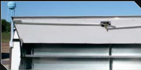
The inner door liner is standard on side doors except doors with optional windows