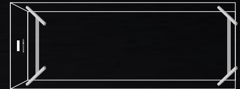
Heavy duty Utility Racks