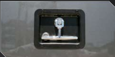
The folding T handles have OEM automotive grade Strattec Key cylinders for long life and trouble free operation.