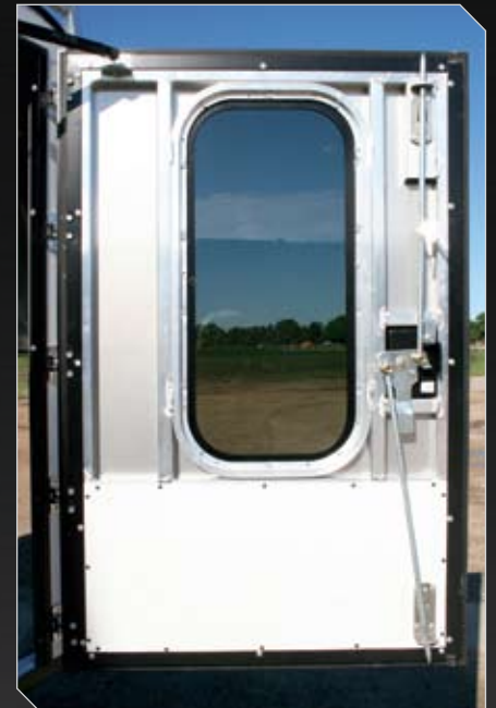
The lower inner door panel protects the outer door panel from damage caused by shifting cargo.