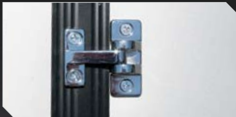
The marine grade chrome steel hinges used on all full back doors provide superior strength and durability.