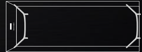
Light duty utility racks