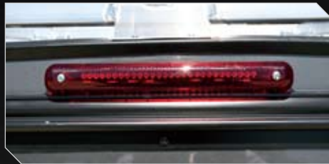
The sealed LED brake light ensures maximum visibility and trouble free operation.